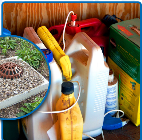
Lawn chemicals run off your yard when it rains.