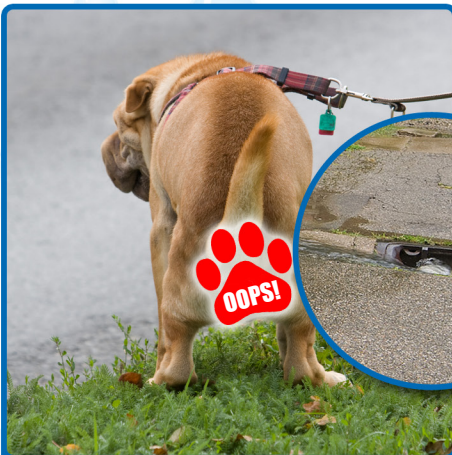
Pet waste left on the ground contains harmful bacteria.