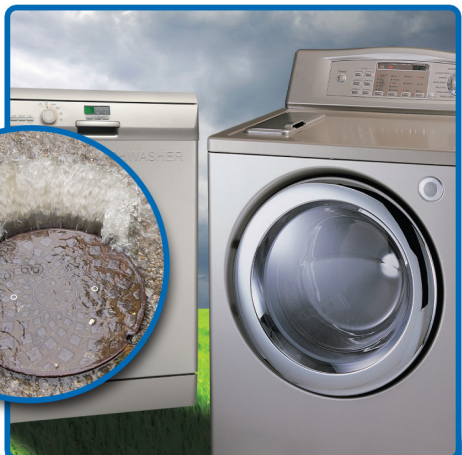
Washing machines and dishwashers used during rain events can cause sewer overflows.

MSD needs your help to clean up the streams in Louisville Metro.