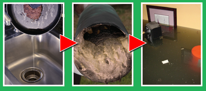
Fats, oils, and grease (FOG), create clogged pipes that lead to basement back-ups.

When greasy wastes are washed into the plumbing system through your sink or garbage disposal, they can stick to the pipes. Using your garbage disposal or a grease-cutting detergent does not keep FOG out of the plumbing system. Garbage disposals shred solid material into smaller pieces, but do not prevent FOG from flowing down the drain. Grease dissolving detergents can pass FOG through your household plumbing but the grease will still cause problems in the sewer lines.